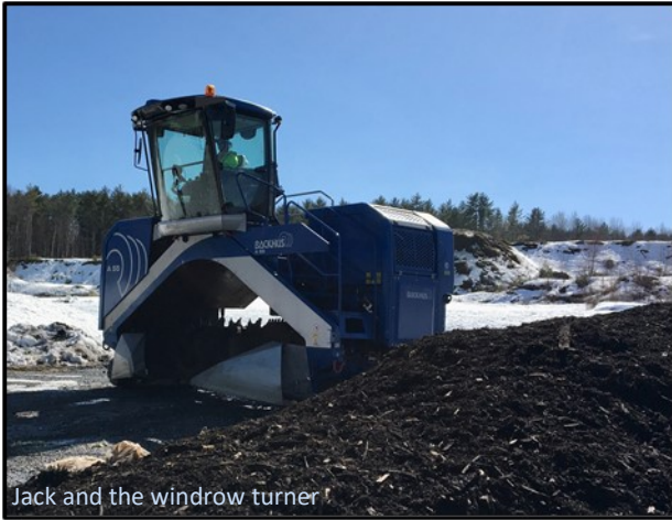
Jack and the windrow turner

Upon arrival, material must be immediately covered and/or incorporated into a mix. This means that if haulers arrive at 3:30 or 3:45, GMC staff often have to stay late to get the material covered. The takeaway... please try to arrive by 3:15pm. If you have thoughts on hours of operation, please contact Dan at dgoossen@greenmountaincompost.com .