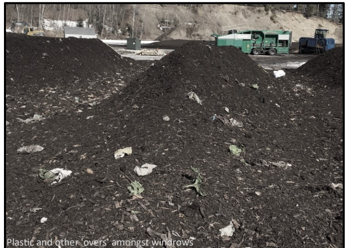
Plastic and other 'overs' amongst windrows

*Not to be collected in food waste containers but accepted via drop-off at GMC or CSWD's Drop-Off Centers.